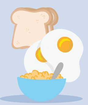
Breakfast is a great start for all the learning and activities coming ahead in the day