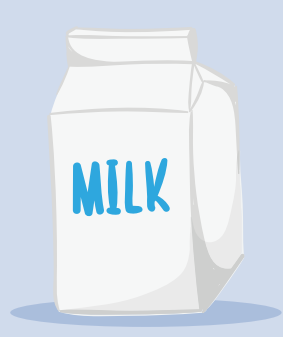
Calcium rich food like Milk & Yoghurt will give you strong bones for life